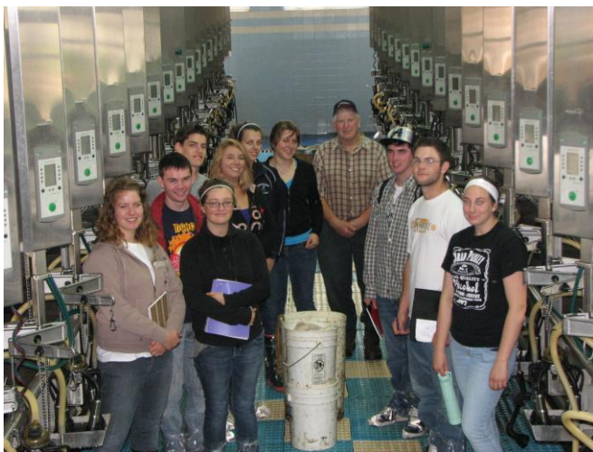
IFB Students on a field trip

There are currently 10 students enrolled at NSAC for first year of program and there are nine students enrolled at our partner university in the Netherlands. These two groups of students and faculty met in Iceland during the last week of August for a one week orientation. Our 10 IFB students are getting excited to head to the Netherlands this fall for the second year of the program. When they return to NSAC to complete their third year of study, they will bring their European classmates back with them. IFB students have had the opportunity to enjoy more industry field trips and guest speakers this past year compared to their peers in other programs.