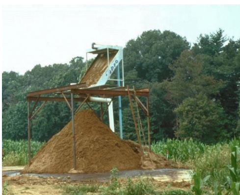
An inclined screen separator.

It is desirable to concentrate the nutrients from liquid manure for several reasons, including: (i) odour reduction, (ii) decreased loading on lagoons and other treatment systems, and (iii) the production of a valuable, easily manageable, nutrient rich, solid product.